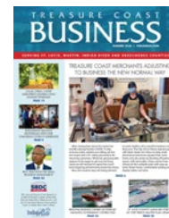
TREASURE COAST BUSINESS Publishes January, April, July and October

Yes, I will advertise in the next edition of Treasure Coast Business in the following ad size: