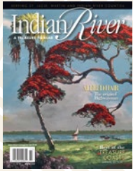
WINTER Publishes January

Make sure your business is represented in 2020 in the leading magazines in St. Lucie County and the Treasure Coast.