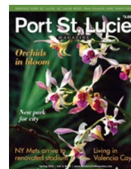
FALL Publishes September

Yes, I will advertise in the above checked issue(s) of Port St. Lucie Magazine in the ad size checked at right: