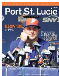
SUMMER Publishes June