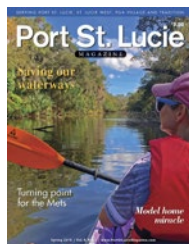
SPRING Publishes February