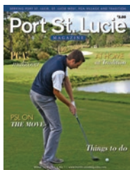
WINTER Publishes January