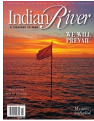
SUMMER Publishes May