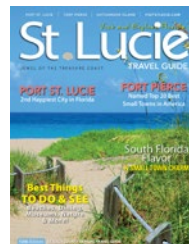
ST. LUCIE TRAVEL GUIDE Publishes December

Yes, I will advertise in the next edition of the St. Lucie Travel Guide in the following ad size: