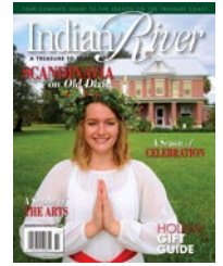
HOLIDAY Publishes November

Yes, I will advertise in the above checked issue(s) of Indian River in the ad size checked at right: