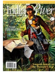
FALL Publishes October