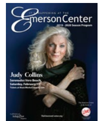
EMERSON CENTER PROGRAM Publishes November

Yes, I will advertise in the next edition of the Emerson Center Program in the following ad size: