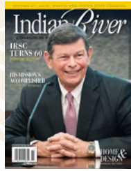
SPRING Publishes March