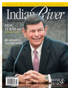
SPRING Publishes March