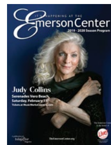
EMERSON CENTER PROGRAM Publishes November