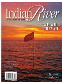
SUMMER Publishes May