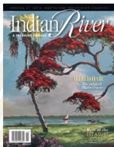
WINTER Publishes January