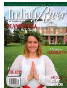
HOLIDAY Publishes November