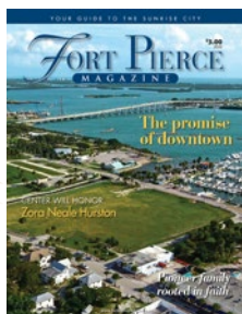
FORT PIERCE MAGAZINE Publishes February