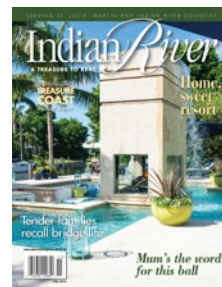
FALL Publishes October